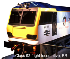
Class 92 freight locomotive, BR

EXPERIENCE: Involved a varied range of projects for clients including 3M, Boots, Eurostar, London Underground and British Rail. Actively involved in large rail transport projects ranging from 'new build' to refurbishment of existing rolling stock. Also worked on brand conscious consumer products where effective interpretation of client markets was essential.