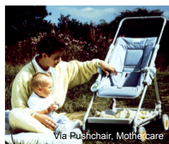
Via Pushchair, Mothercare

EXPERIENCE: Designed children's furniture utilising panel, knock-down and dowel assembly techniques. Had significant involvement in the design of the 'Via' pushchair which became the best selling pushchair in the U.K. for the first 2 years of its production. Gained experience in design and installation of shop fittings and signage.