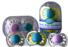
Pacifiers, Boots and Púr