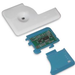
Disposable diagnostic platform, working prototype, SmartSensor Telemed