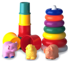
Toys, Tommee Tippee

SUPPORT EXPERIENCE: Gained expertise in achieving the best aesthetic and engineering results from injection moulding, vacuum forming, blow moulding (extrusion and injection) and 2 shot insert moulding (manual and automatic). Products have been produced in a wide range of thermoform, thermoset plastics and rubbers. A wide variety of mould tools have been commissioned and production monitored both in the UK, US and the Far East.