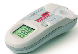
NewTek blood glucose meter, Hypoguard

SUPPORT EXPERIENCE: The majority of devices designed required the effective housing of analogue and digital electronics. Plastic and metal prototype toolmaking was sourced, commissioned and monitored personally or by delegation to colleagues. In collaboration with engineering colleagues regulatory compliant test protocols were produced, externally vetted and implemented. Following workplace consultation, created core quality procedures which led to the successful implementation of ISO:9001 quality management system.