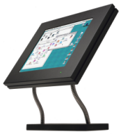
Flexi Screen Concept, Digital View (HK)

SUPPORT EXPERIENCE: Experience was gained in the design and development of fabricated metal products. Final production components were created through the use of extrusion and casting in aluminium as well as CNC folding, stamping and laser cutting in aluminium and steel. Manufacturing component drawings for these parts was typically produced by myself.