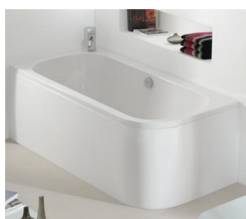
Initial standard bath, Adamsez

JOB DESCRIPTION: Product designer for a leading manufacturer of baths and shower enclosures in Northern Ireland.